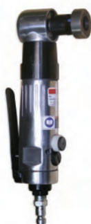
PLT-50/A Tip Sharpener (optional)

Phone: +1 760-407-1414 Toll free (US only): 877- PRO SPOT Fax: 760-407-1421 E-Mail: info@prospot.com