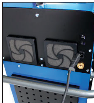
Charging system for on-board batteries (4).

Convenient 110V/220V outlet on back for easy re-charging! Can also be charged while welding. Load test of battery system included.