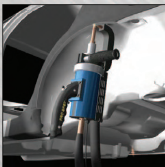
Wheel House welding with PS-52 Arm makes it possible to weld the most difficult applications.