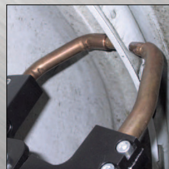
X-Adapter Arm is a must for tight areas with limited space for the electrodes.