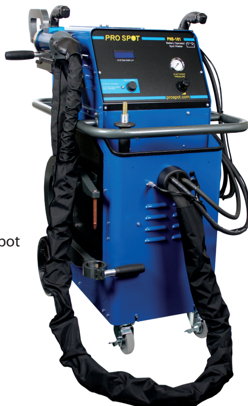
PHS-101 Hybrid Spot Welder

The Hybrid Spot now features weld current monitoring to show the operator how much current is delivered to each weld. The unit can also alert the user when weld current falls below a preset level.