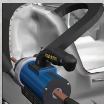
Consistent weld quality with short weld time.