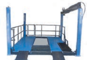
12000LR, Lube Rack