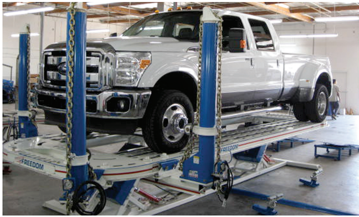
Utilize up to 4 towers