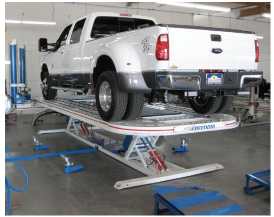
Platform raises up to a 42" working height