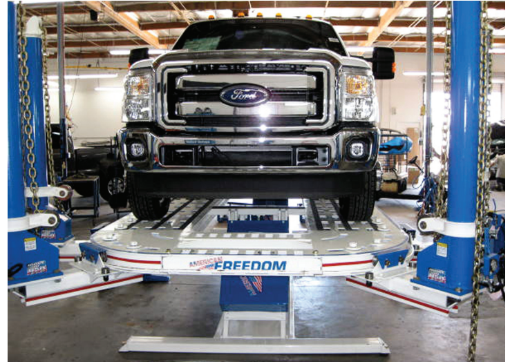
Wide 92" bed

Specifications are subject to change without notice.